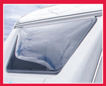
Double glazed windows for thermal & acoustic insulation

Alloy rims - proven performers with a touch of class