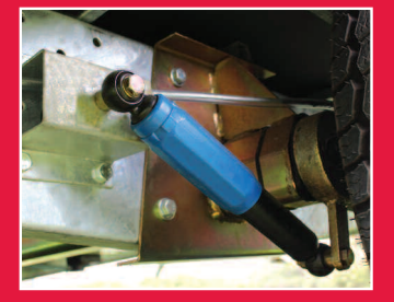
Independent Suspension AL-KO IRS - proven dirt road capable