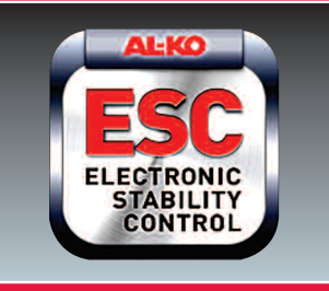
AL-KO Electronic Stability Control optional