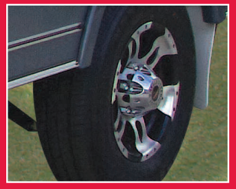
Alloy rims - proven performers with a touch of class