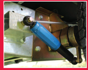
Independent Suspension AL-KO IRS - proven dirt road capable