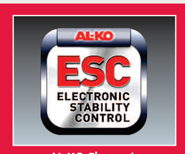
AL-KO Electronic Stability Control Optional