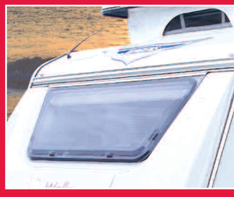
Double glazed windows for thermal & acoustic insulation