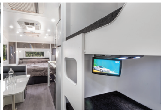
Core Razor photographs shown.